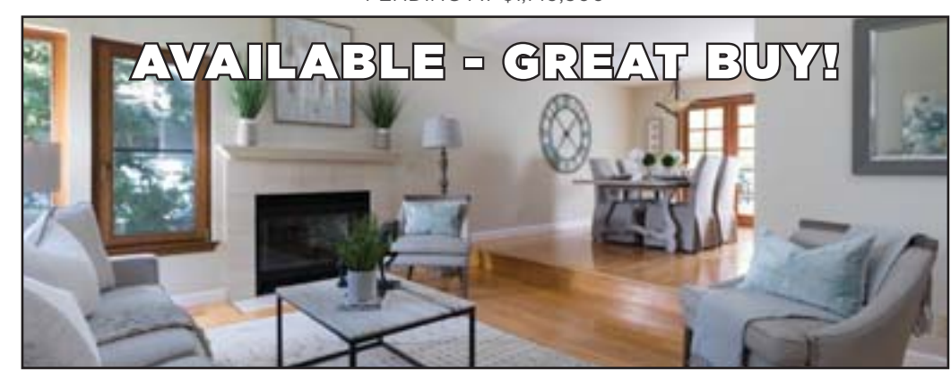
15 VIA BARCELONA | 4BR/2.5 BA | 2577± SQ.FT. OFFERED AT $1,044,000