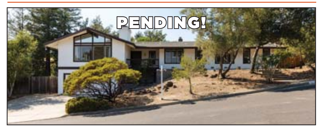
182 FERNWOOD DRIVE | 4BR/2.5 BA | 2955± SQ.FT. PENDING AT $1,149,500

925 376 7777 kkatzman@pacunion.com License # 00875484